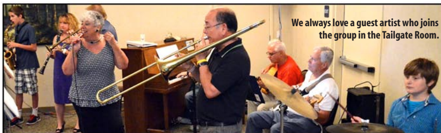
We always love a guest artist who joins the group in the Tailgate Room.